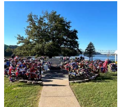
Floral tributes at the Memorial Burial Site

Fifth , the third Thursday of each month, “Third Thursdays at the Museum” we will host programs in the conference room where staff and guest speakers will talk history. The topic will be the story of Lexington and Concord and how the Valley Militia responded 250 years ago. Find the schedule on our website: thecitizensolder.org