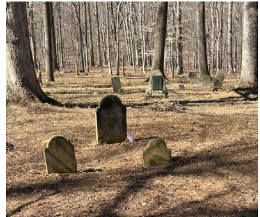
Veteran Memorial Sign 1749 Glebe Cemetery Before and after Restoration Effort

Fourth , commemorating the 250 th Anniversary of the Revolution, the CSEF participated in the historic reunion at Point Pleasant, recognized by Congress as the “first battle of the Revolution.”