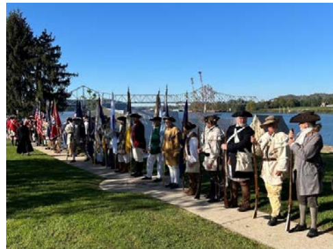
Reenactors Muster at PP for the 250 th Anniversary