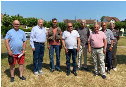
Consenvoye and 29 th Assn. select the Memorial Site

Seventh , our educational tours will take us to D-Day and the dedication of our new Monument in Consenvoye, France, honoring the 116 th Regiment and the 29 th Division's participation in the Meuse Argonne-Offensive leading to the end of WWI.