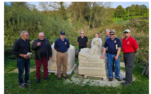
Approval of Initial Sculpture Work