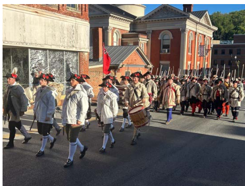
Militia Musters and Departs Staunton for Pt. Pleasant

Fourth , commemorating the 250 th Anniversary of the Revolution, the CSEF participated in the historic reunion at Point Pleasant, recognized by Congress as the “first battle of the Revolution.”