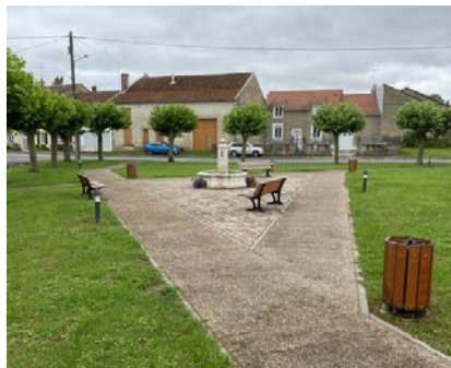
Future town Site of the WWI Memorial