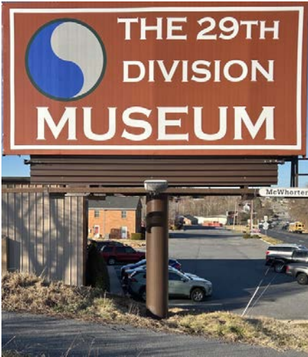
New Lee Highway Billboard

I hope this finds you well. I wanted to bring you up to speed on a number to things happening at the 29 th Division and 116 th Infantry Regiment Museum. First , the signage on I-81, coupled with our new billboard sign right above the Museum, is really increasing our visitor numbers. You can't miss us!