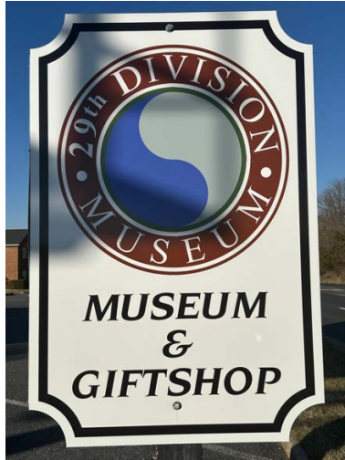
Additional Street Sign